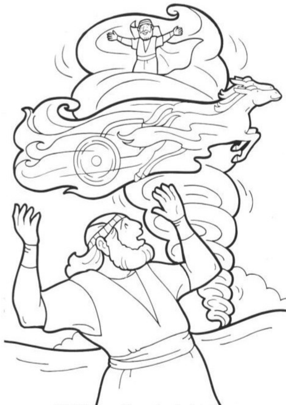
Elijah is taken to heaven in a chariot of fire